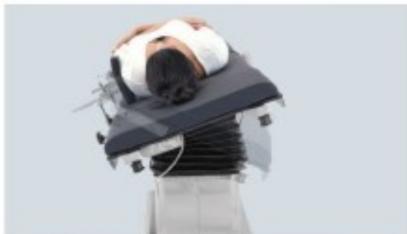
Lateral Tilt - Left & Right