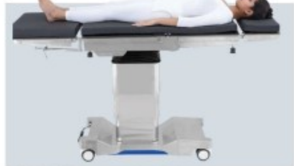
Height Adjustment - Up & Down